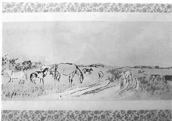
“Shishu Shinkei” by WATANABE Kazan 「四州真景」 渡辺崋山 (画)